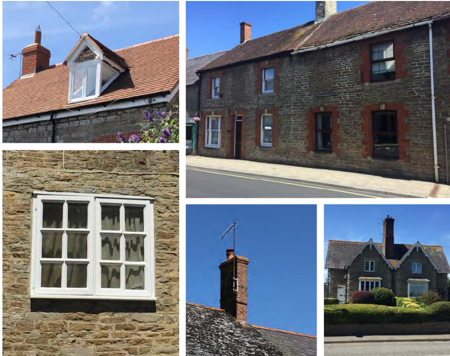
Image showing Architectural Detailing of Properties within Stalbridge