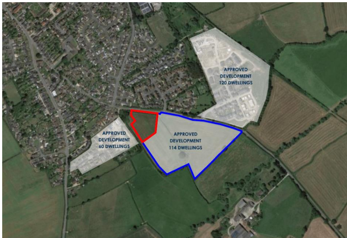
Figure 1 - Aerial Site Location