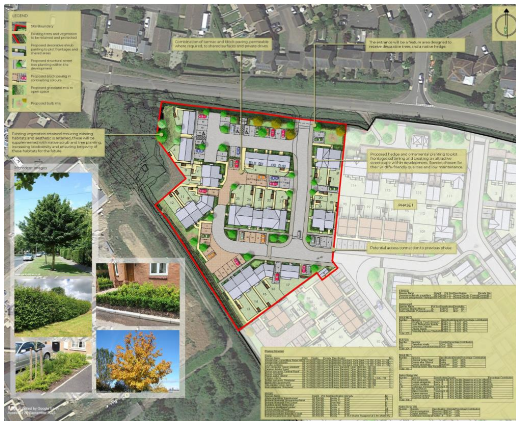
Extract from ACD Environmental Landscape Strategy Plan